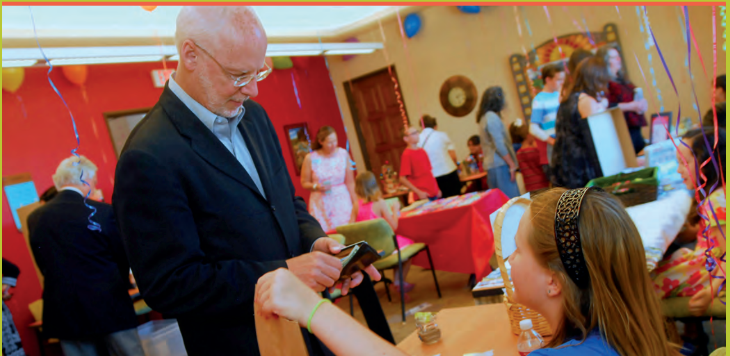
Board and community members at the first Accion Kid Entrepreneur Fair.

We would also like to acknowledge and thank the community of Accion interns and volunteers who have contributed their time and talent to our mission during the year.