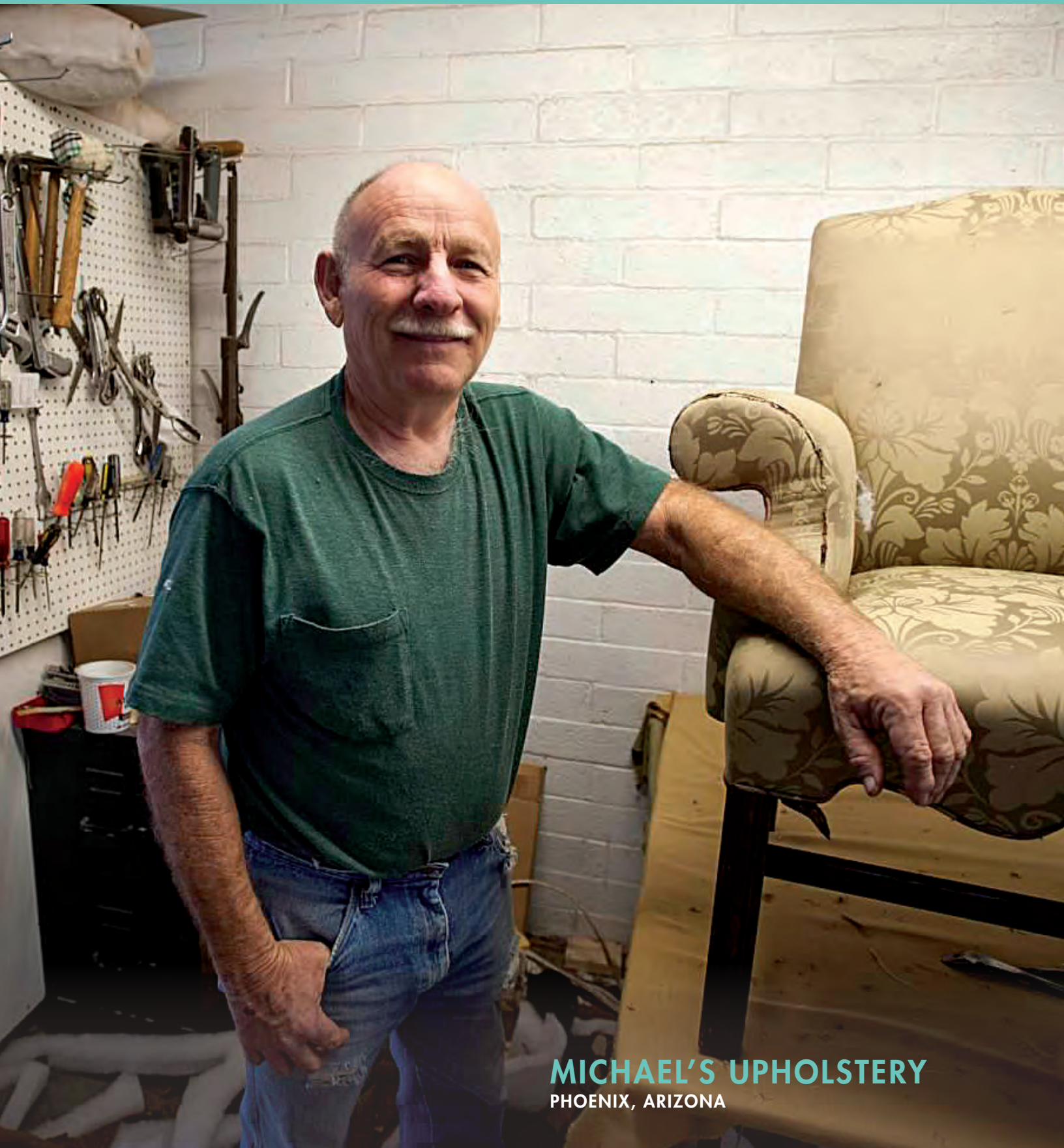
MICHAEL'S UPHOLSTERY PHOENIX, ARIZONA