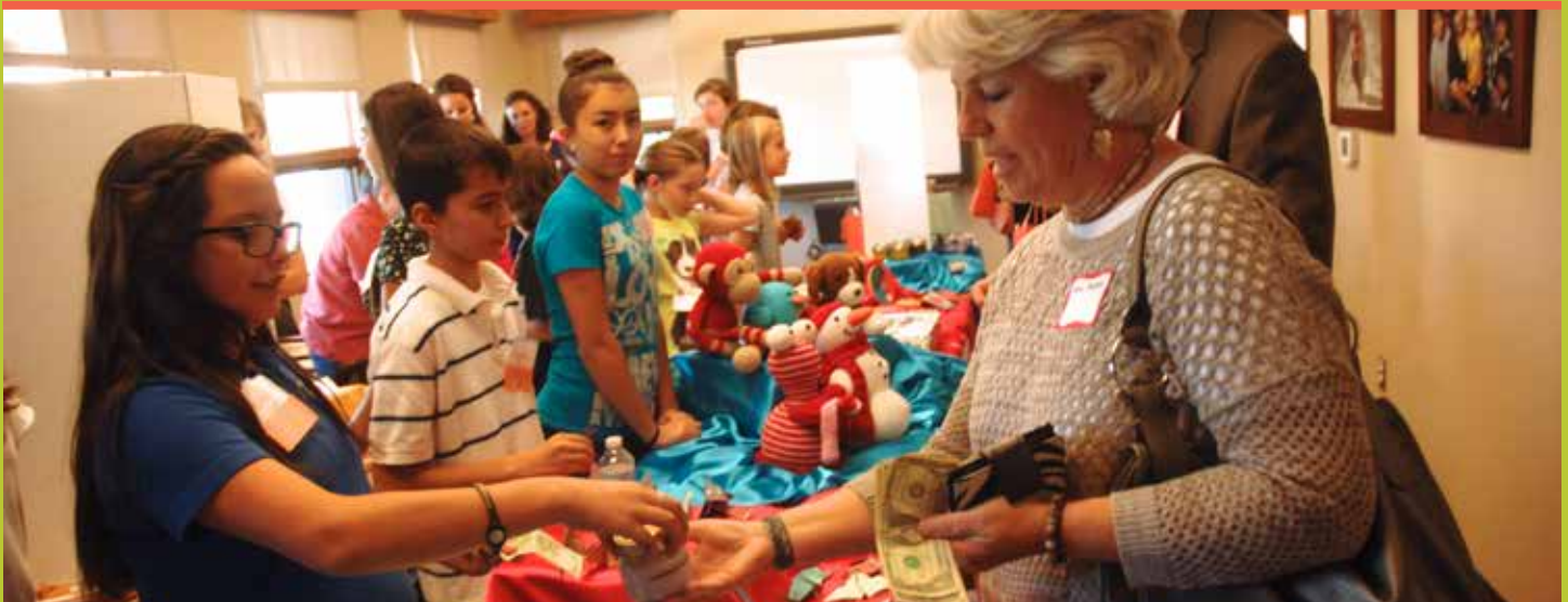
Community members enjoy the Kid Entrepreneur Fair at Accion's 20th Anniversary Celebration.

We would also like to acknowledge and thank the community of Accion interns and volunteers who have contributed their time and talent to our mission during the year.